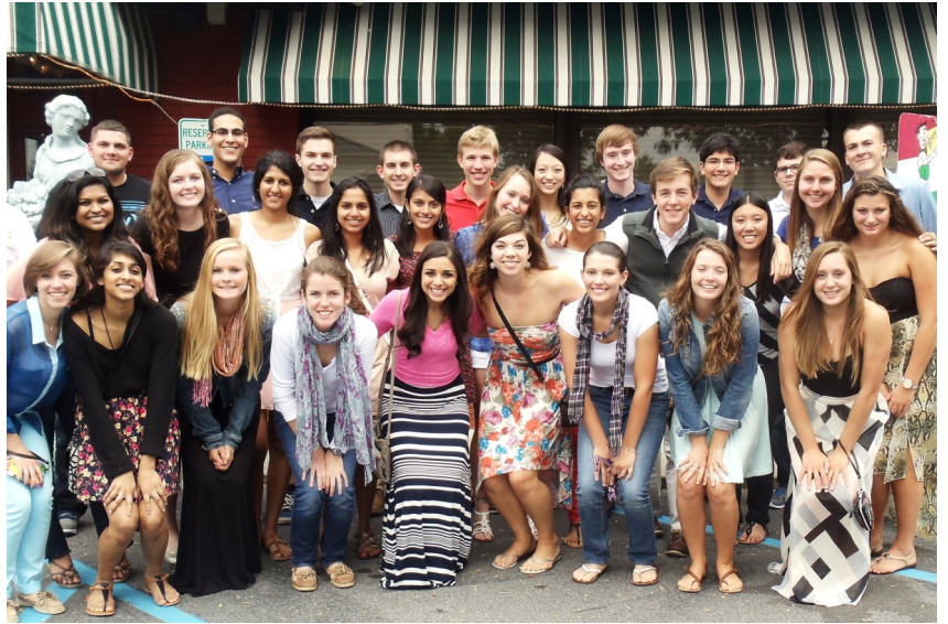
Above: The sophomores took the freshmen out to eat for the annual Sophomore-Freshman Class Lunch at the very beginning of the year