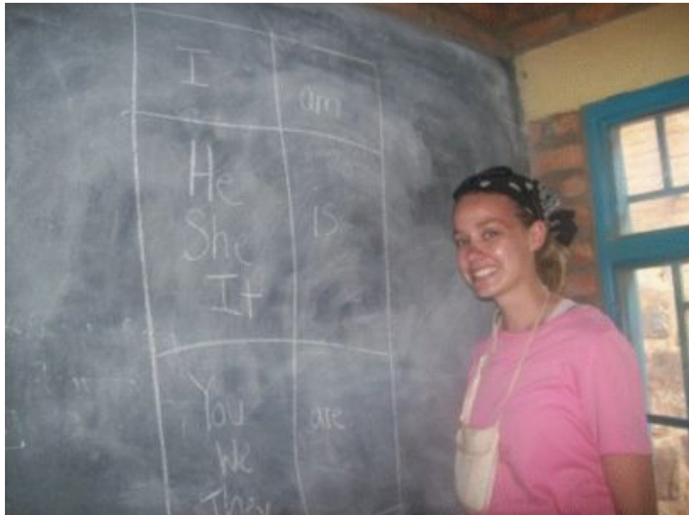
Photo 6. Me putting an English lesson on the blackboard.