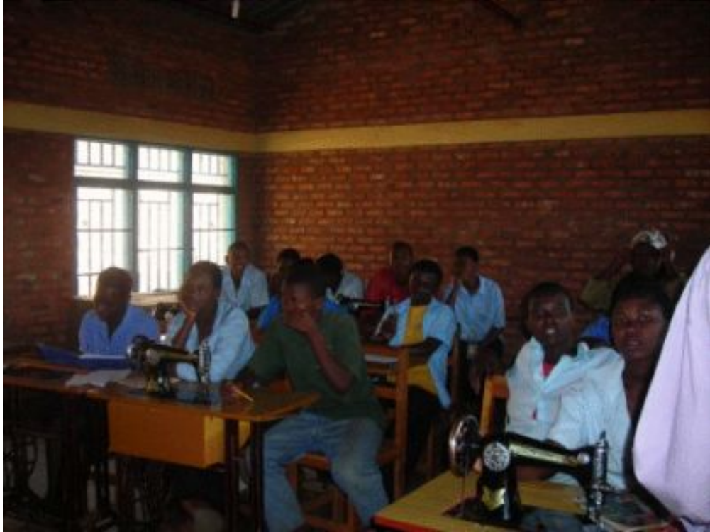
Photo 5. Our English students in a typical classroom at the school.