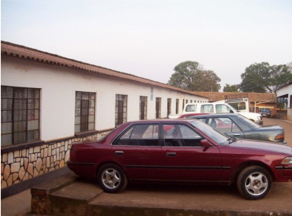
Photo 2. The guesthouse in Kigali, Rwanda, where we lived for 7 weeks. The rooms were simple but clean.

The next day, it was time to meet the children at the orphanage. There were about 150 children, all under the age of 5, at the Missionaries of Charity orphanage in Kigali. Needless to say, it was chaotic at times, but I loved working with the children. They were divided into groups by age, and we tried to spend a little time with each group every day. In the mornings, we fed and played with the toddlers, then the older children (ages 3-5). On some afternoons, we spent time with the infants.