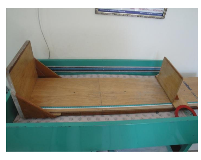
This was the pediatric clinic and the scale and measuring board they used to for the babies.