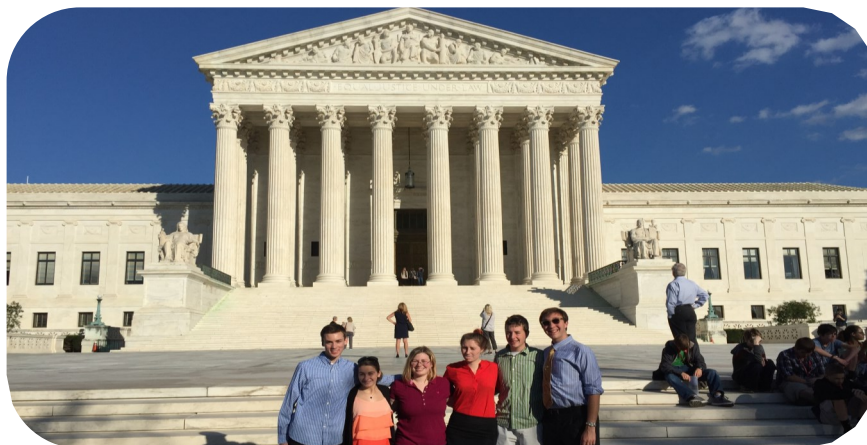
Members of the Political Science Society in front of The Supreme Court