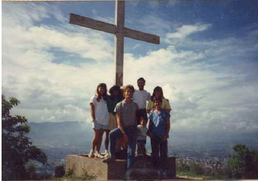
The beautiful view from the top of "our mountain" ←