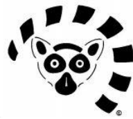
Mada Clinics logo