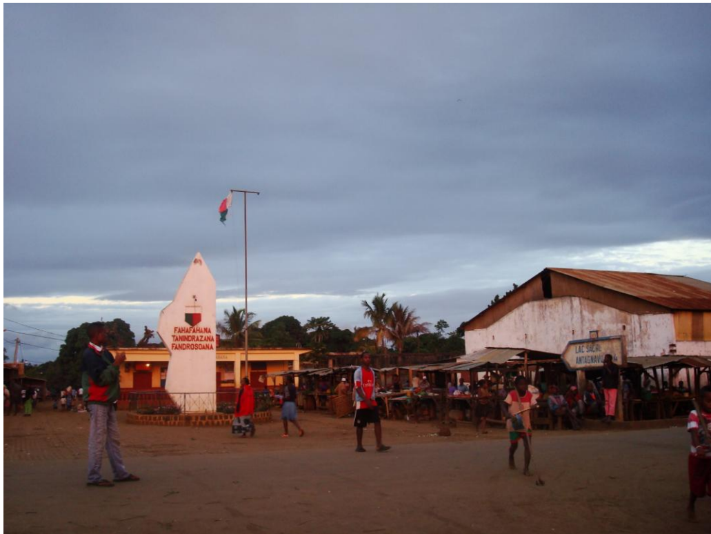
The Anivorano market center