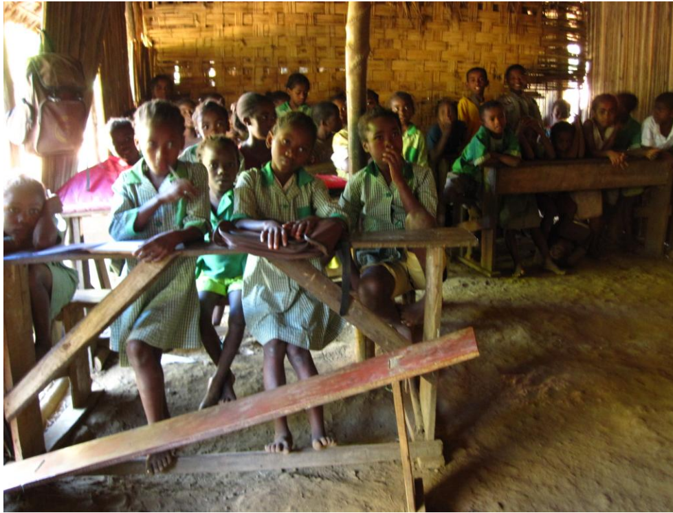
The schoolchildren of Mahamasina were always eager to learn English