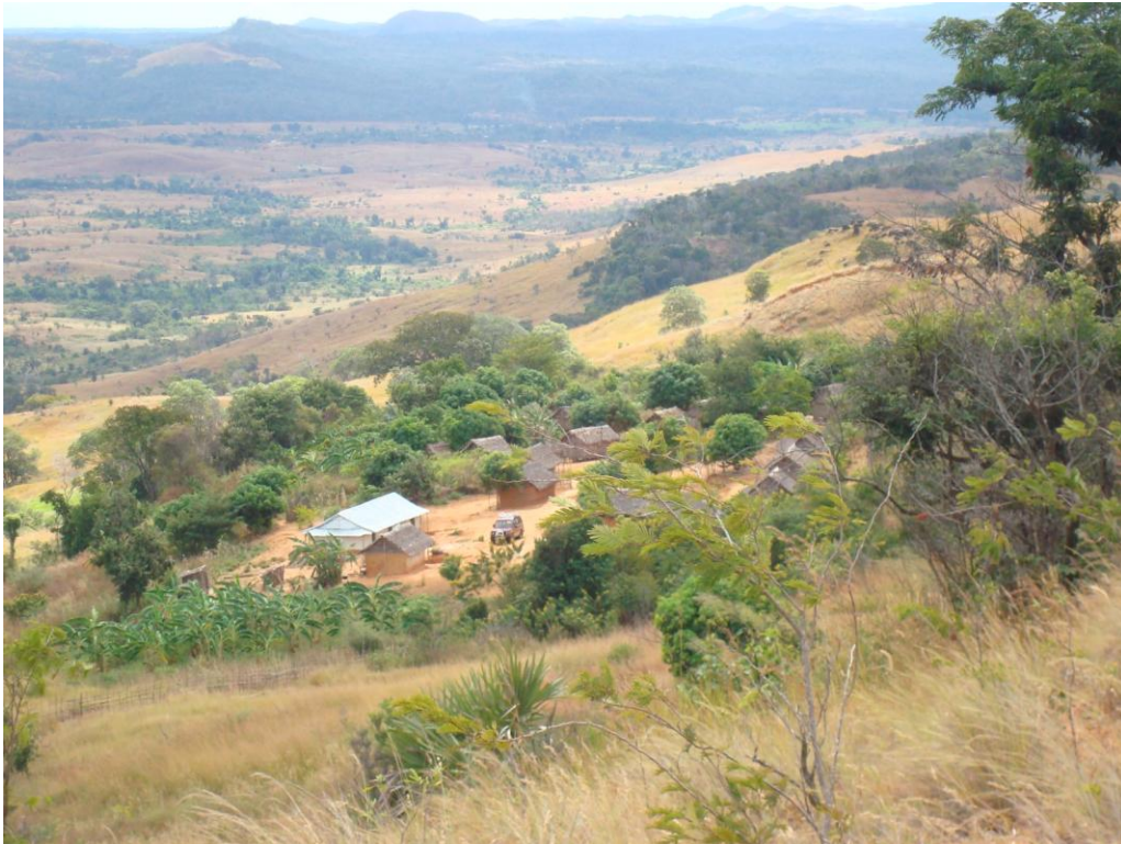
The village of Maventibao