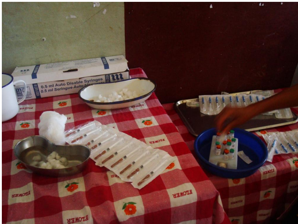
Baby vaccination clinic supplies