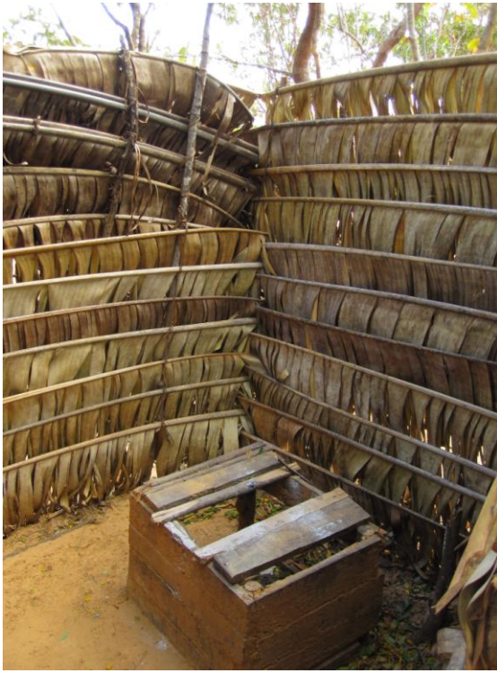
(left) There is no running water in the mountaintop village of Maventibao, so our toilet was a wooden seat above a deep hole in the ground (below) Our “showers” were hot bucket baths using excess rice water, typically enjoyed under the moonlit sky