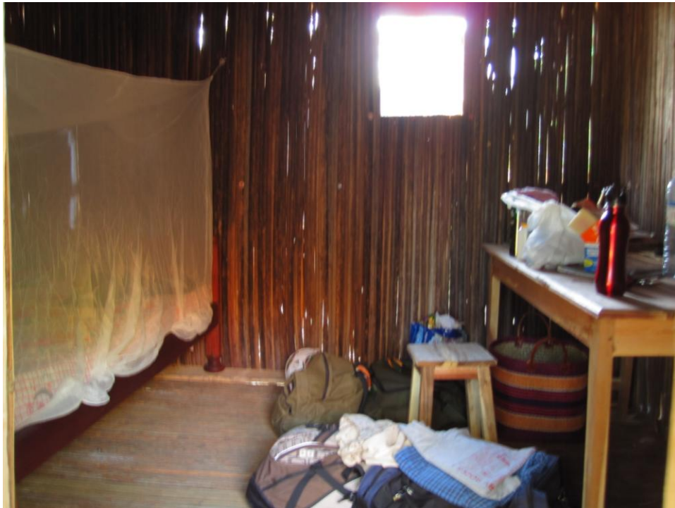
The inside of our hut