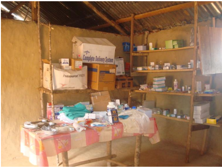
The Maventibao main clinic storage room