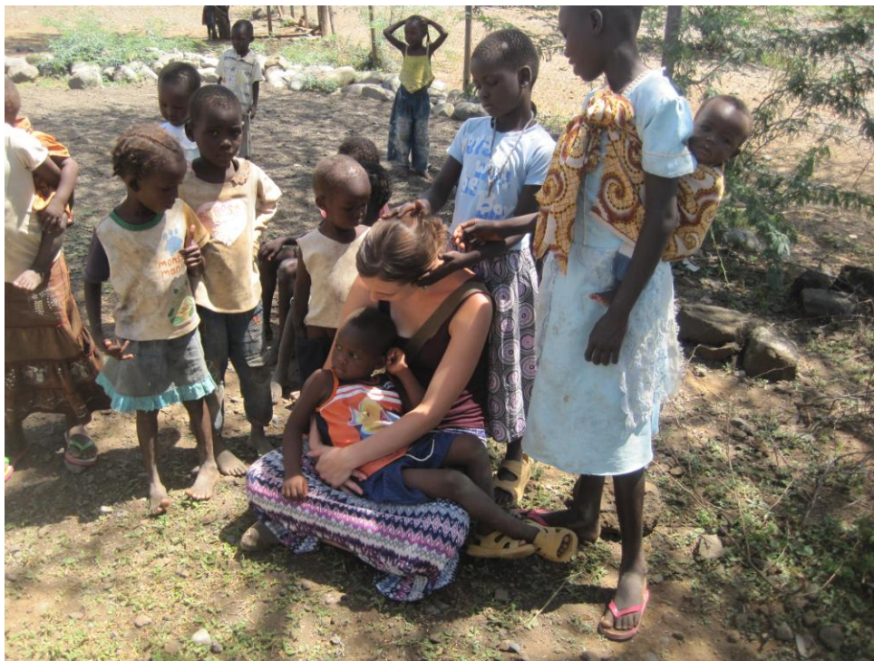
Resting after a long walk. The kids were fascinated with our hair and spent hours touching and braiding it.

At least three afternoons a week we would walk 30 minutes to the primary school in Kampi Trukana. Kampi Trukana is a refuge town for the internally displaced people of northern Kenya. The people that live in this village are impoverished beyond description and HIV is rampant. However, despite the intense challenges they face everyday the children are exceedingly friendly and thoroughly fascinated by our Mzungu (white person in Swahili) presence.