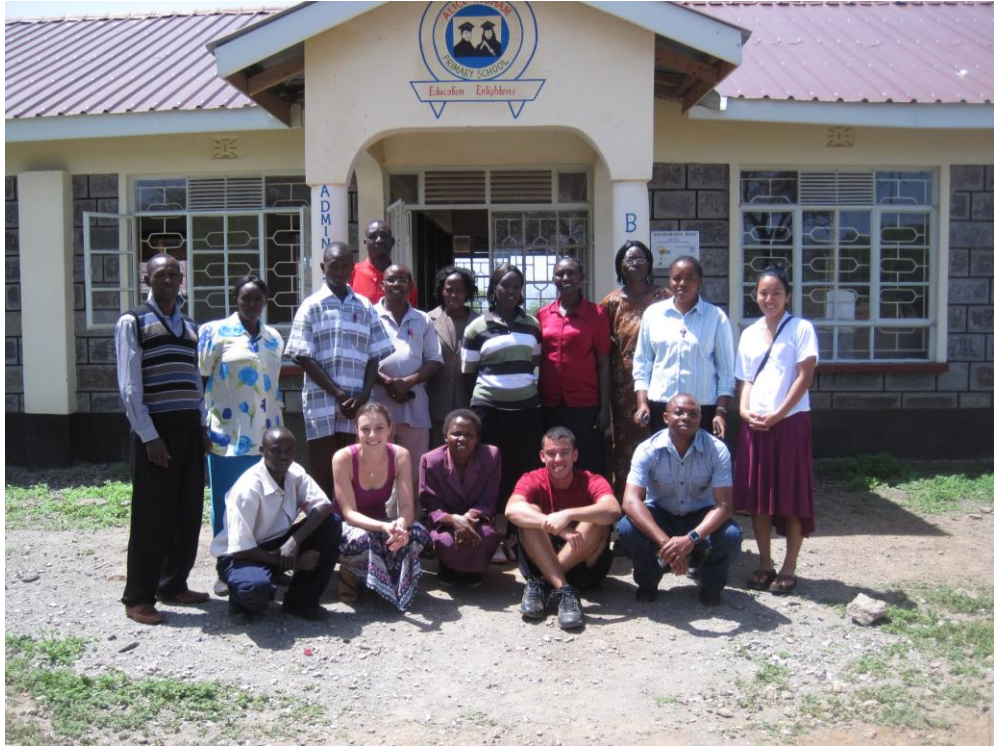
The faculty in front of the main office building at Alice Ingham Primary School