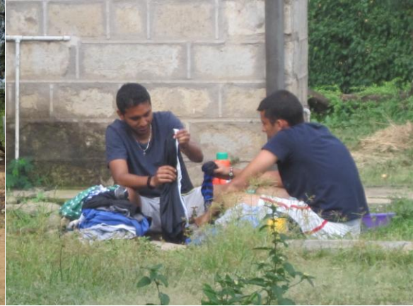
Doing laundry – Kenyan style!

Although the sisters were afraid that it would take us a while to adjust to their way of life we quickly became comfortable with Kenyan culture. This was primarily due to the love, understanding and warmth all of the sisters showed us.