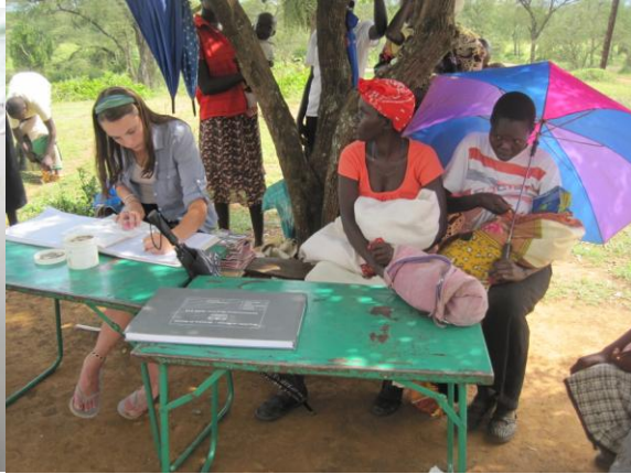
Recording Weight and Height into the government recording books.