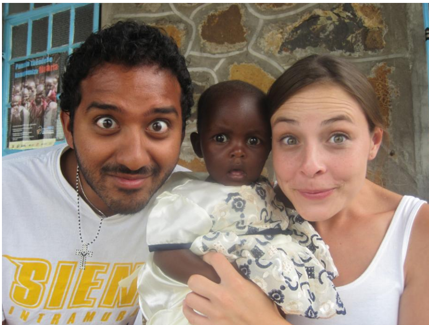
One of our patients - So cute!!!