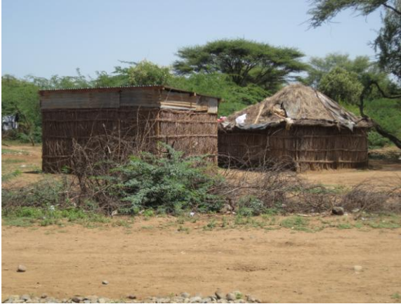
Typical home in Marigat made in the traditional style using sticks for the walls and roof

or cows roaming the streets. Some of the shops in town have electricity during the day but most homes are usually without electricity or running water. Homes in Kenya are much smaller as well and a family of six will share a two-bedroom tin or stick house.