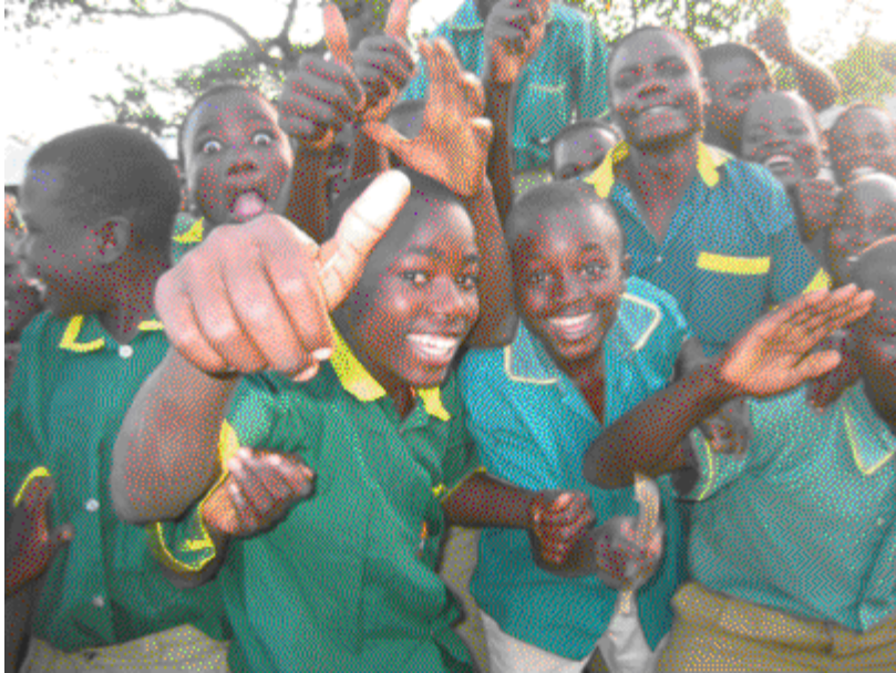
Top: ICODEI school children

Bottom: In many cases, the mobile clinic and EMPOWER classes were held close by or in classrooms of local schools. Children always ran to greet us and loved to jump in for a picture! Before setting up for the day, we spent some time with the children playing some games like limbo and duck-duck goose.