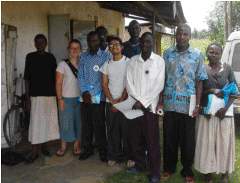
Top: Teaching one of the EMPOWER sessions Bottom: EMPOWER graduates