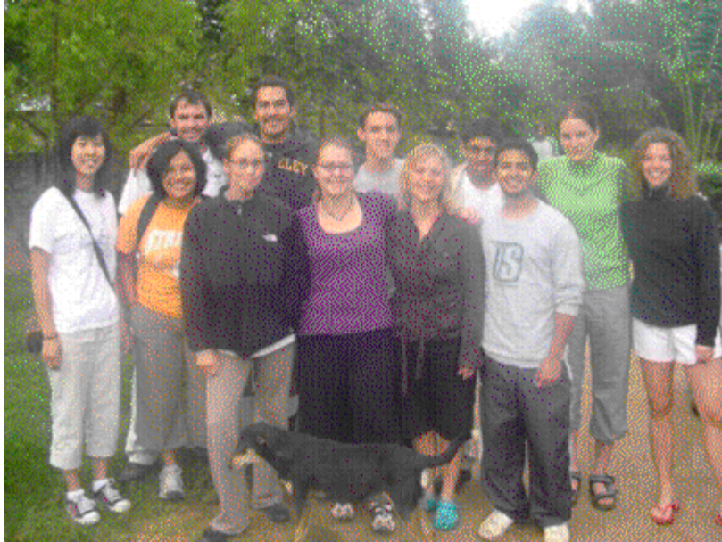
Top: 4-person volunteer huts