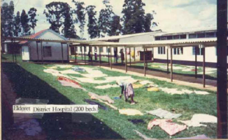
Eldoret District Hospital (200 beds)