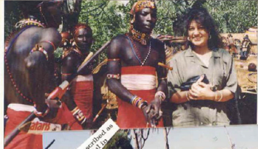
Disaster-ready: Kenyans have been described as being "disaster-ready" because they are all "Kisumu" all the time.