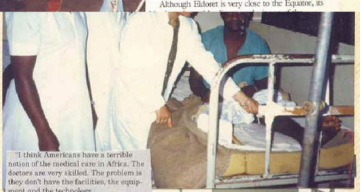
"I think Americans have a terrible notion of the medical care in Africa. The doctors are very skilled. The problem is they don't have the facilities, the equipment and the technology."

Although Eldoret is very close to the Equator, its