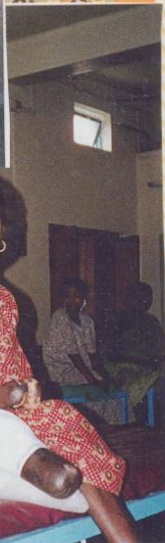
We were honoured to be able to visit the Leprosy Colony of Calcutta. This incredible institution, entirely populated by those afflicted with leprosy, is fully self-sufficient. The residents even spin their own clothing and make their own prostheses.