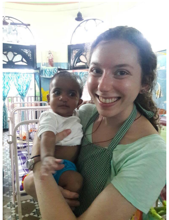
This little baby had cleft palate surgery and is doing great!