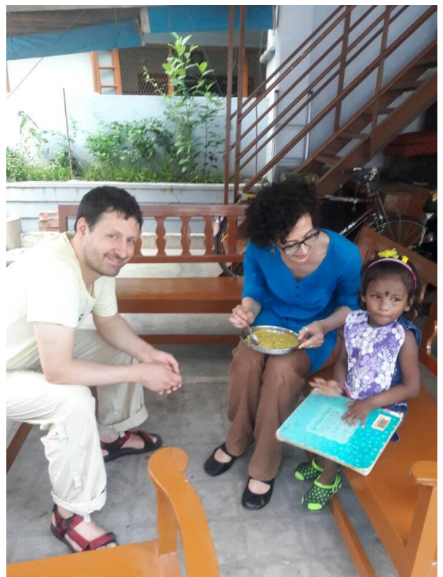
While we were there, we were excited to see a few children get adopted!