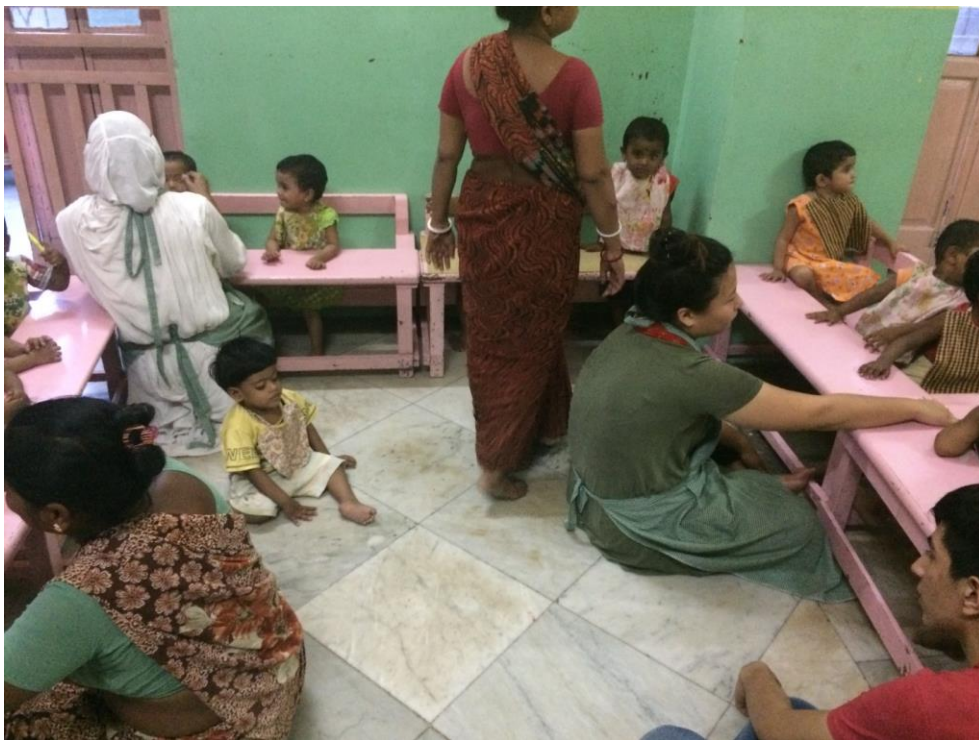
Sometimes, families on their birthday would bring in treats or cakes for the children which they loved.