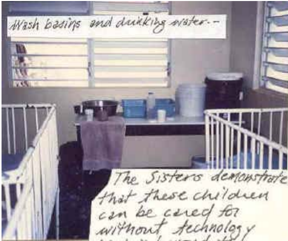
Wash basins and drinking water.--

The "hospital" is a very simple facility - there is no running water... A longterm volunteer nurse is the only medical personnel... Occasionally, doctors will visit to perform physicals, evaluate patients, and so on.