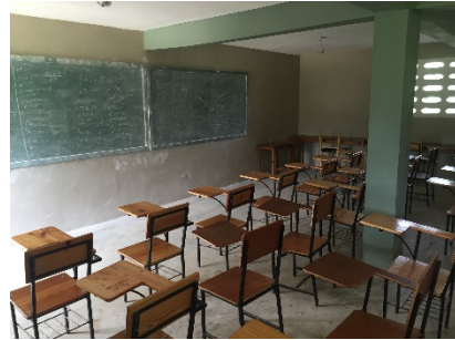
St. Gabriel's Secondary School where we lived for the entirety of our trip and spent the majority of our classroom time.