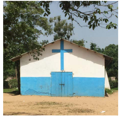
St. Joseph's Primary School where we spent much of classroom time and the local church where we attended services every Sunday.