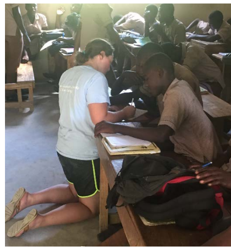
Class pictures and teaching with both students at St. Gabriel's and St. Joseph's.