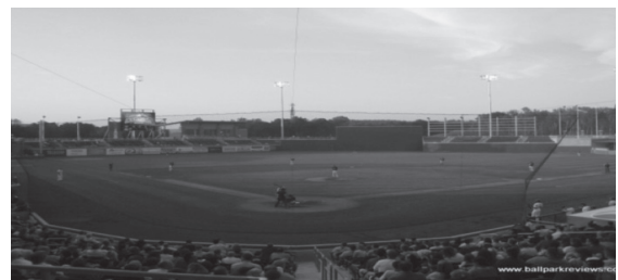
Figure 3. View of Boulder Stadium from behind home plate.

A prime example of this corruption is the construction of the ballpark that was built in Pomona, a small town in Rockland, back in 2011. Boulder Stadium, shown above in Figure 3, was built to bring people together from the surrounding region and to fuel a love for the Great American Pastime. The Rockland Boulders are a part of the Canadian American Association of Professional Baseball. According to Town Supervisor, and initiator of the project, Christopher St. Lawrence, this ballpark put the Town behind $38 million. This figure does not include the $14 million used to meet State toxic soil regulations, or the $175,000 yearly lease. However, Preserve Ramapo, a political group that sued, but obviously lost, to prevent the ballpark’s construction, estimated its cost to be closer to $70 million. St. Lawrence believes that the revenue from the stadium will allow the Town to pay off its required annual debt payment, $1.12 million, by the end of the year. The team is only averaging about 2,500 fans per game though, which is only half capacity, and the stadium is not making as much as it was supposed to. This means that the property owners are picking up the slack when paying their taxes (Lieberman).