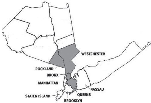
Figure 2. Map of Counties in the lower New York area.

education (Henderson). One specific example is the schooling of the mentally disabled. Programs are being cut and they are receiving less aid. My family lives in Suffern, a village with very high property taxes that are well above the median. Although my younger brother is in high school, my parents will continue to pay for teacher salaries and such after he graduates. This is illogical because they will essentially be paying for teachers who are no longer educating their children. Although this is how it works in every state, it less of a burden on the homeowners when the taxes are lower. Many elderly residents cannot keep up with the constant increase. No matter where they live, they will have to pay for things that may not concern them, like school budgets. However, since the taxes are so high in Rockland, they are moving to areas that have lower taxes, like New Jersey, because it is less of a financial burden for them (Foord). The average property tax in New Jersey is $7,529 (PropertyPilot). This is a more ideal number for taxpayers.