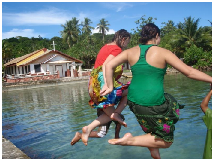
Jumping in the ocean with our Chuukese skirts- swimming in a skirt is harder than you'd think!