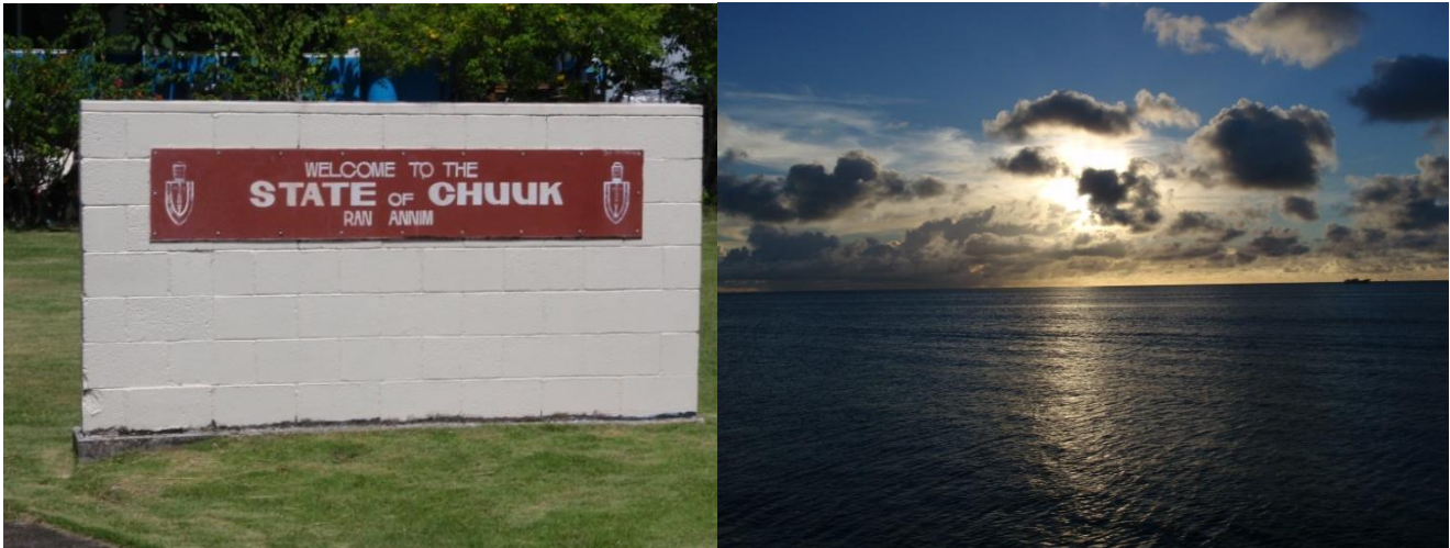
The Welcome Sign at the Chuuk International Airport, and one of our first sunsets.

This summer, Tara Kelly and I were fortunate enough to travel to Micronesia, a small country in the Pacific Islands. After 34 hours of travel, we finally arrived on Weno, the most populated, but also the most impoverished, island in Chuuk (the capital of Micronesia).