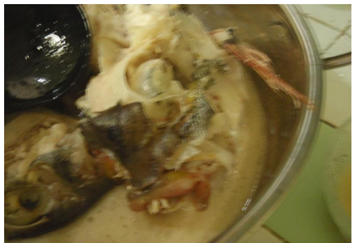
A large fish cooked whole- the head, eyes and brain are considered delicacies