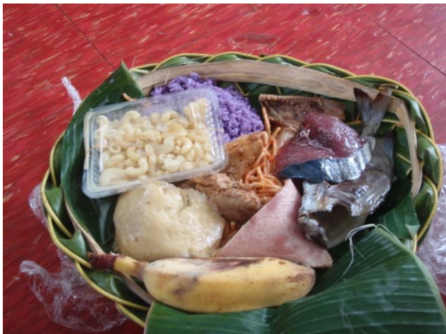
A traditional Chuukese feast basket of "Macaroni and Cheese," purple rice, kon, puna, spam, banana, sashimi, and another raw fish

Going to different islands each week taught me so much about the rich Chuukese culture. All women in Chuuk, no matter the island, are expected to wear skirts or muumuus (long, loose dresses) that go below the knee. While men sit at a table, women are traditionally expected to eat on the floor, and are not allowed to stand while their brother(s) are still seated, thus they must move about on their knees until they are out of the room. These customs were so different than anything in the U.S., but helped me realize how unique the Chuukese culture is. One of the other biggest cultural shocks was the food: