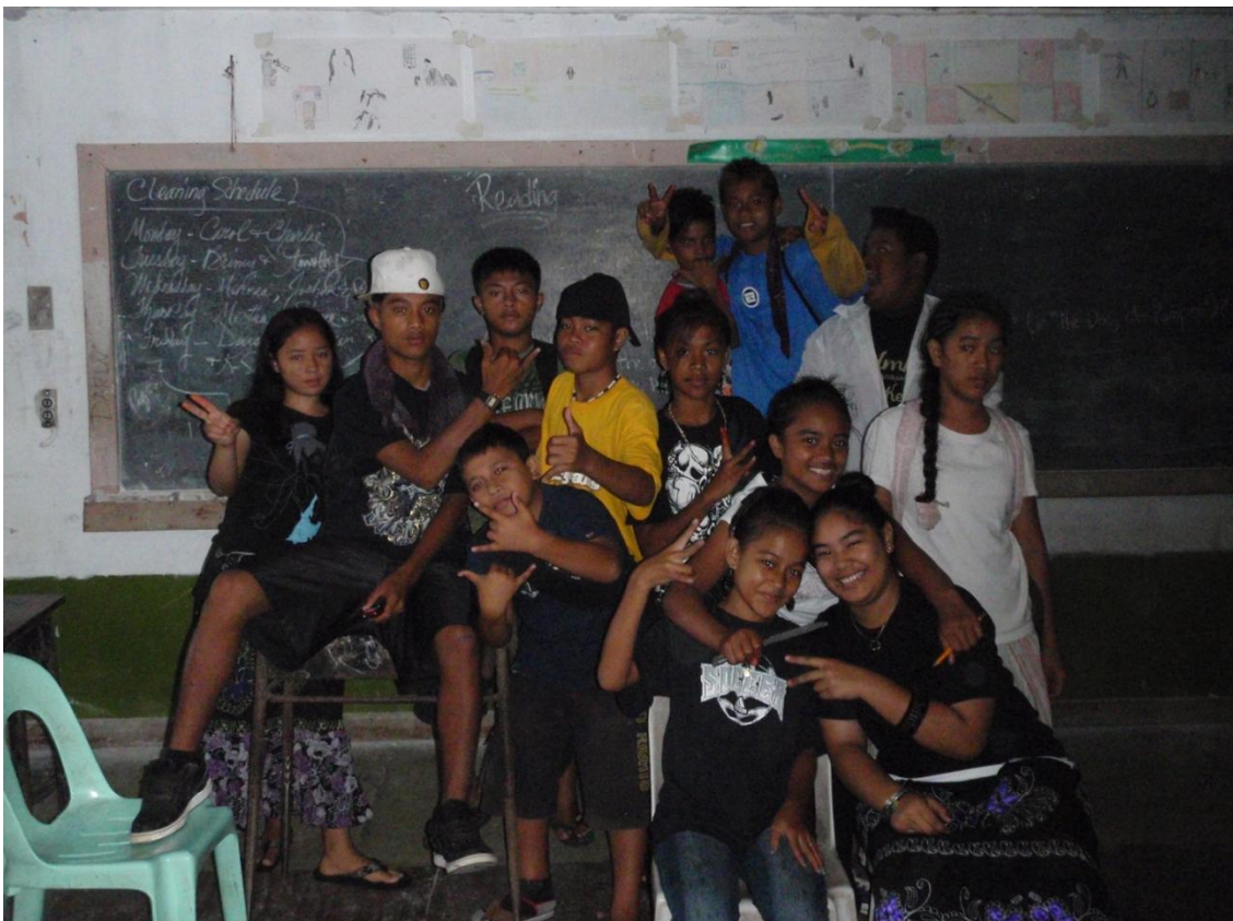
My 8 th Grade Class at St. Cecilia's School