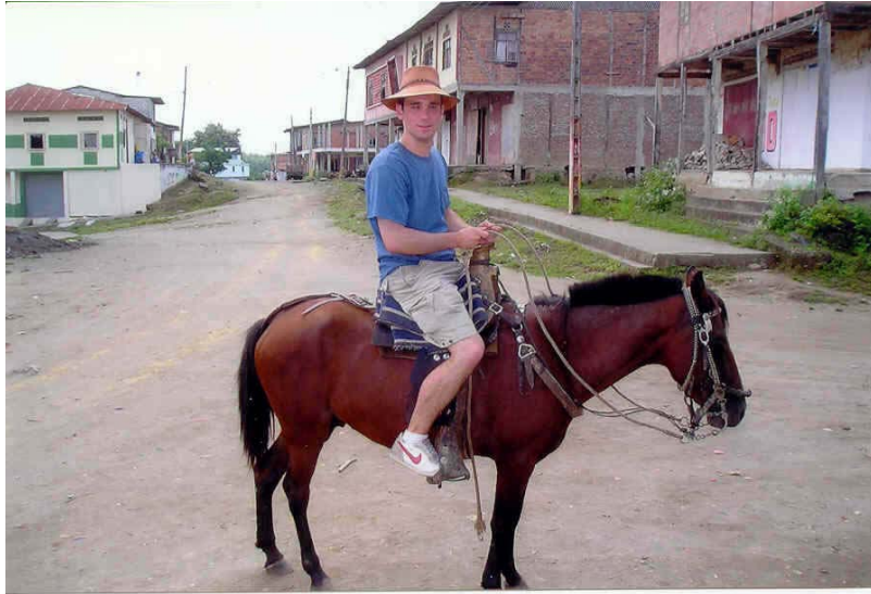
Riding a horse around town.