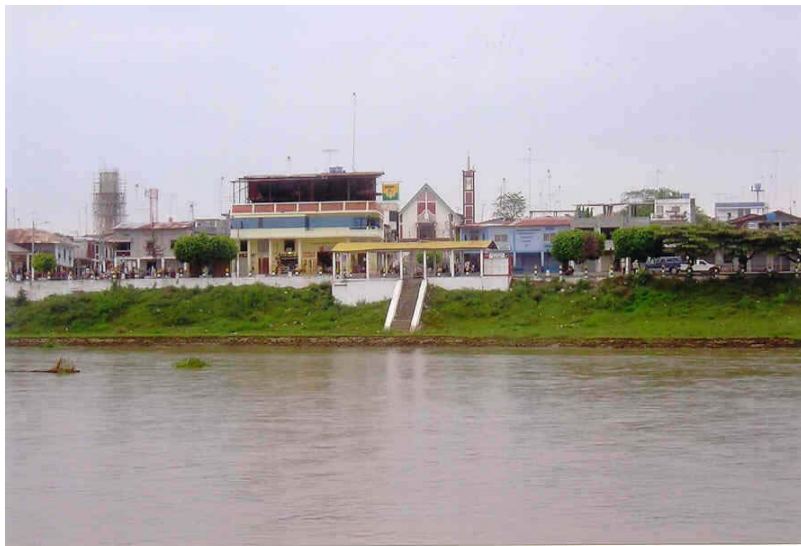
The Church in Colimes, the town we stayed in.