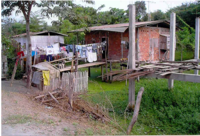
A house in the village of Colimes.

As soon as we arrived at the village that we were staying in, the differences between our two countries became apparent. Some people didn't have any shoes and their homes were nothing more than four walls with a thatched roof. Like I said before, the people were still happy. Everyone said hello, kissed hello and goodbye, and always offered a smile. We stayed in places where we didn't even have water for the shower. We used a large bucket full of water. We visited people who drank and washed in the river water. Yet, everyone invited us in and offered us food and drink.