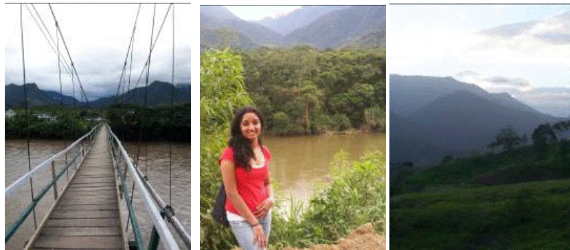
(Left): Bridge across Rio Yacuambi to Parish Guadalupe; (Center): Pit stop along the way from Piuntza to Guadalupe; (Right): Un Buen Paisaje

From the highlands of Quito we flew into a tiny airport in Loja. As we walked out of the plane we were completely surrounded by gorgeous lush mountains. From there we caught a taxi to the bus terminal, where we took a bus for 2 hours even farther east to Zamora. Zamora is smaller than Loja, however, is the largest town where people from its neighboring villages can find basically anything they need, from fruits to internet. To continue onto the villages of the Parish Guadalupe, we took another bus in the direction of Yacuambi. There is only one dirt road alongside a mountain the entire way for both directions of traffic. With all our carry-on baggage lying on top of us, the bumpy bus ride was a nice massage to add to the beautiful scenery. Looking down from the side of the mountain you can see an Amazon River valley, el Rio Zamora (River Zamora), until the road splits off at La Saquea to either Yanzatza or our direction, Yacuambi. From there the river continues to branch off into el Rio Yacuambi (River Yacuambi).