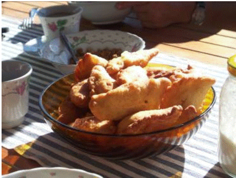
Although not a common dish, one of my favorites: Empanadas!!