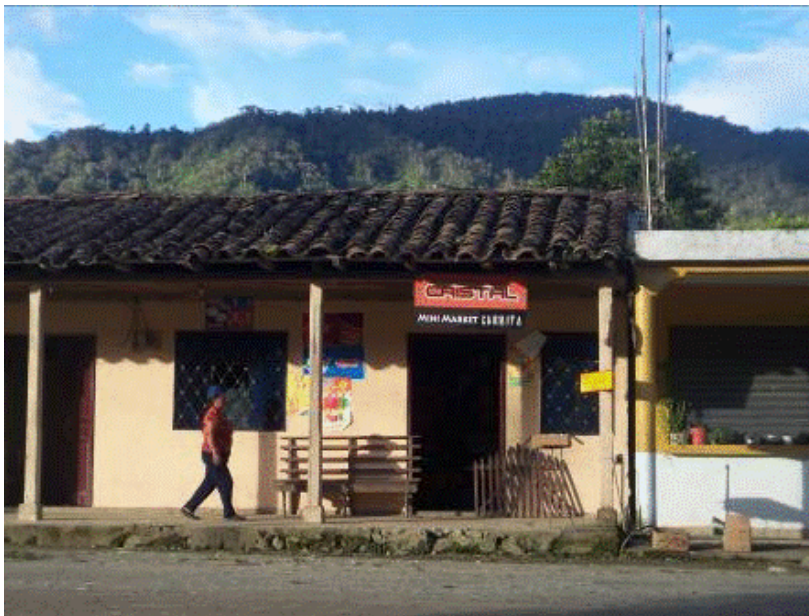
A View of Carmita's Tienda from the Park

We were dropped off in the center, in front of the village park. In the middle of each pueblo you can find a tiny, well-kept park where the villagers of all ages go to play, occasionally hold meetings or just relax. We were to meet Carmita at her tienda (store). Carmita's store is one of the few small ones also characteristic of a village. The stores are usually connected to their modest houses, so they are open as long as the storekeeper is awake and usually hold the simple necessities so trips to Zamora do not need to be made so often.