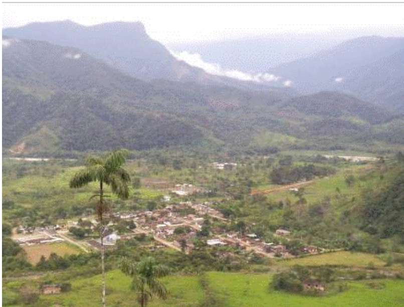
View from on top a mountain looking down on Piuntza