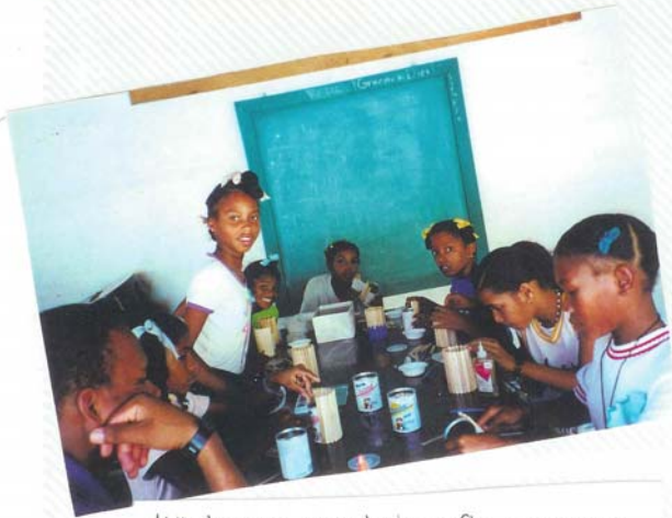
At the day camps, we had arts + crafts, "snack-time," and played various sports while integrating religious songs + prayer.