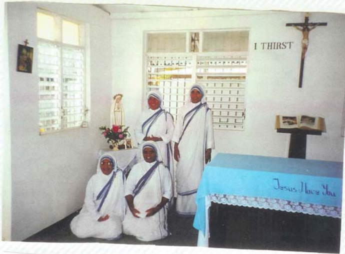
↑ These are the 4 sisters who ran the nutrition center where we worked.