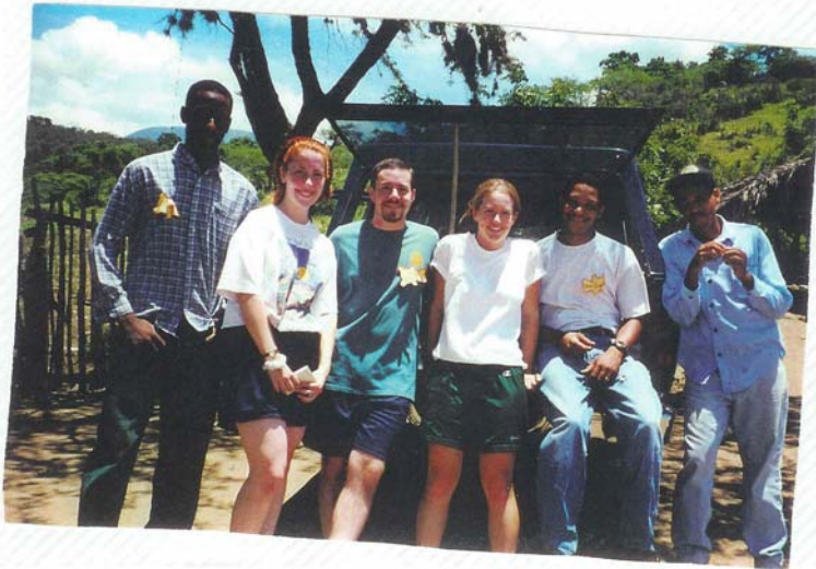
↓ Local volunteers helped us run day camps for children in different areas.