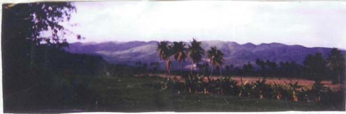
Above: The beautiful mountains of Las Matas de Farfan. Specifically this photo was taken on the way to Las Matas near San Juan.