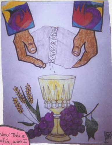
Left & Right: The Sisters working in the nutrition center asked me to replicate some of their favorite postcards onto large pieces of posterboard.