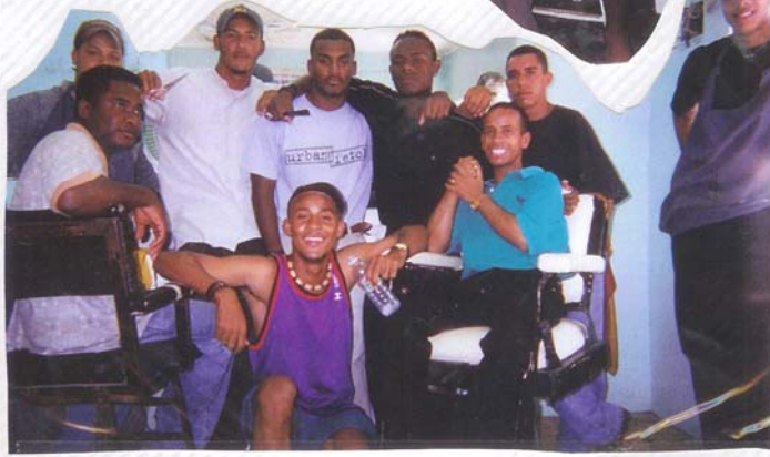
Left These are my boys from the local barbershop "La Clave"