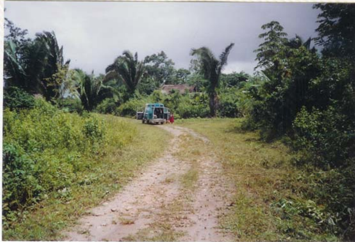
These two pictures are from the state run clinic in San Antonio. The above picture is of Sue and I in front of the state run clinic. They focused upon prenatal and child health but they dealt with a variety of medical problems while I was there. They also ran a mobile clinic (an old ambulance) that served the more outlying regions.