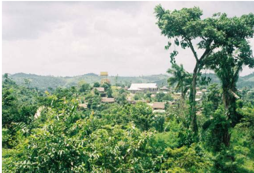
SAN ANTONIO, BELIZE