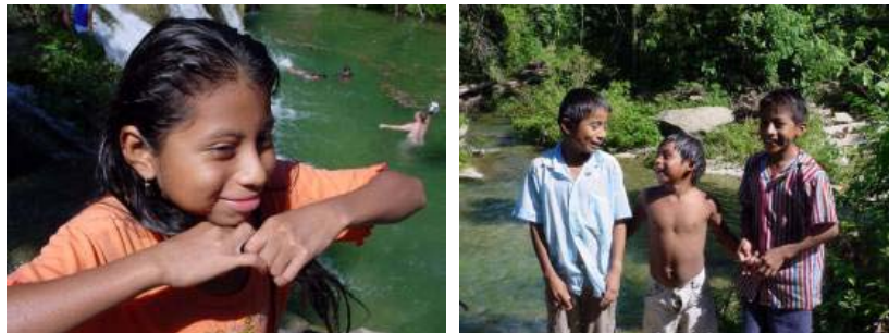
No matter where I went, I never had trouble finding a smile. Happiness isn't judged by how expensive your car is, what kind of clothes you wear, or who you hang out with. It is just another part of every day life in Belize. I will never forget the smiles, the eagerness, and the friendships I made during my short but fulfilling trip to Belize