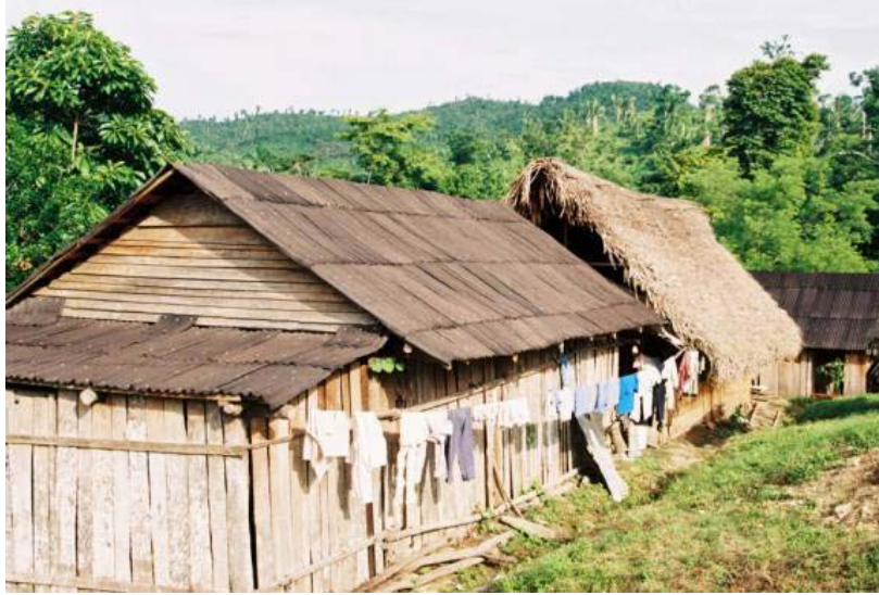
Typical thatched house in the village of San Antonio, Belize